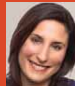
Rosalind Wiseman Masterminds & Wingmen