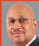
Baruti Kafele Closing the Attitude Gap